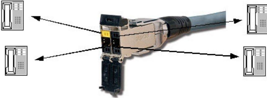
Typical call/fax center cable sharing implementation